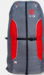
Bolero 7 4.75 kg (S Size)