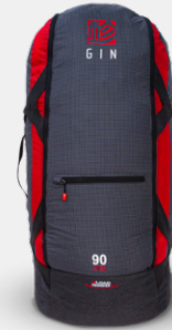
Bolero 7 4.75 kg (S Size)